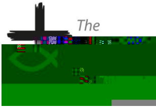
Table Top Discussions